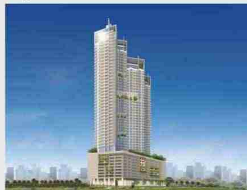
Ajmera Aeon, Mumbai