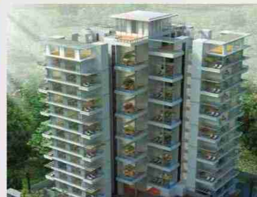
Ajmera Aria, Pune