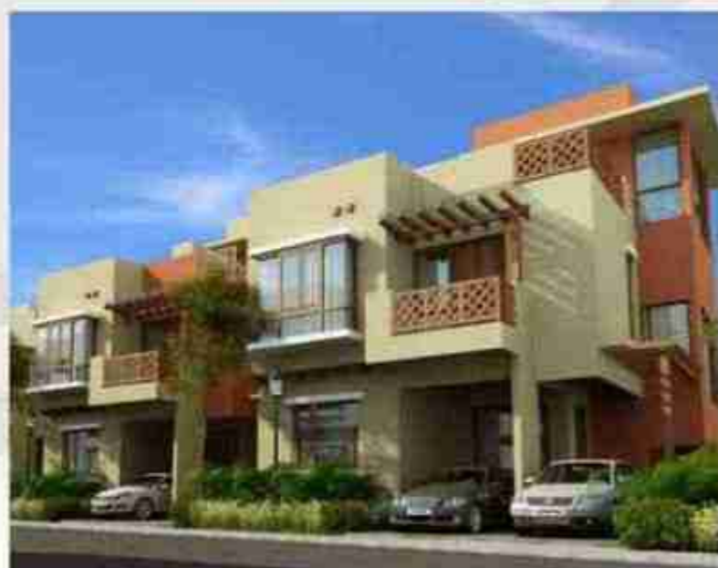
Ajmera Villows, Electronics city