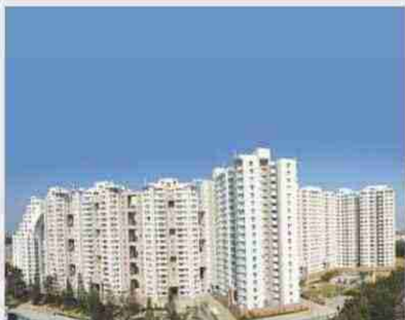
Ajmera Infinity, Electronics city