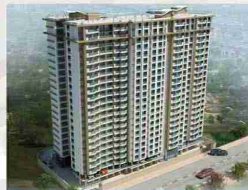
Ajmera Pristine, Mumbai