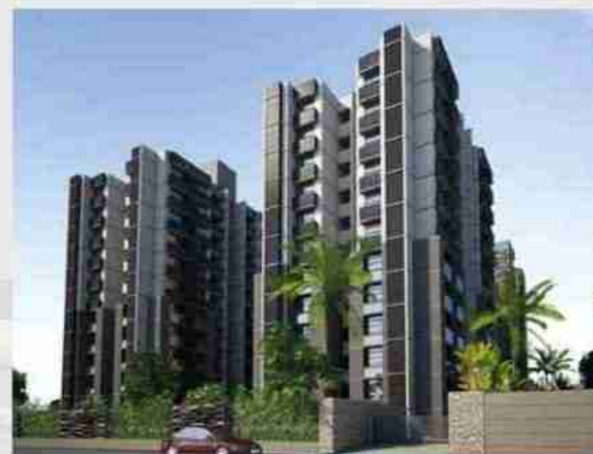
Ajmera Enigma, Ahmedabad